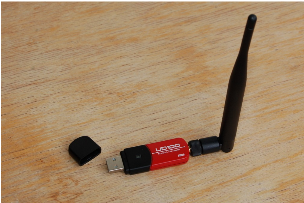
Figure 3: The Sena Parani-UD100 Class 1 (100 mW) Bluetooth 4.0 dongle connected at its RP-SMA port to an aftermarket 2,4 GHz dipole antenna provides an open field signal at a range of up to 600 m.

Good to know: GNU/Linux recognises this Bluetooth adapter right out of the box. There is no need to install any driver. I wrote a separate, detailed article about connecting the miniVNA PRO over Bluetooth using GNU/Linux.