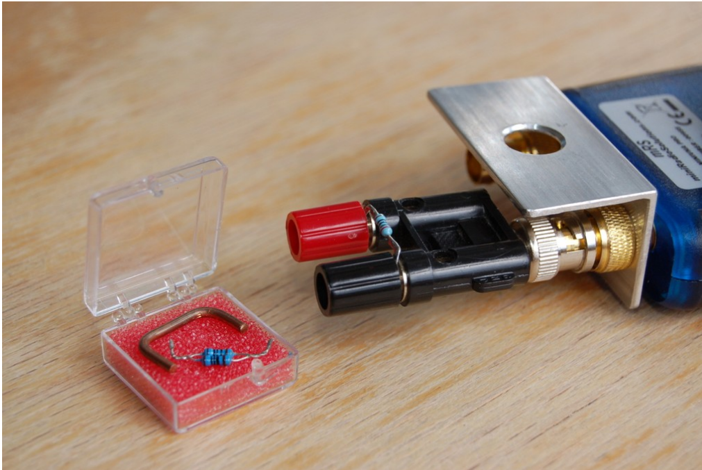
Figure 6: A calibration kit for banana terminals. The tiny plastic box on the left contains a short and a 50\ \Omega load consisting of two high-precision 100\ \Omega low-inductance metal film resistors in parallel. On the right, a high-precision 200\ \Omega low-inductance metal film resistor for measuring components of CL-OCFD antennas .

A BNC to banana terminal adapter turns out to be quite handy for measuring components and antennas. Like any VNA measuring lead, such an adapter requires a SOL calibration kit. SOL stands for short, open and load. Calibration allows for cancelling out the effect of the adapter over a wide frequency range. It will put the measuring plane of the VNA right at the level of the banana terminals.