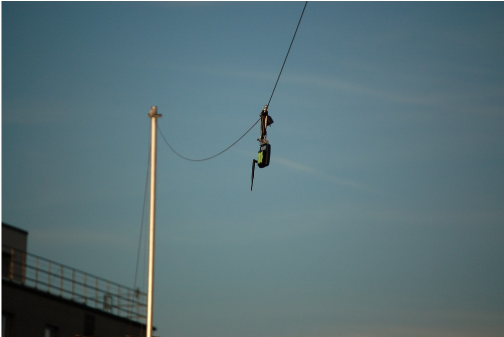
Figure 4: The modified miniVNA PRO hanging from the center of a HF dipole at about 15 m (50 ft) above ground. A balun is not required for taking accurate measurements. The VNA can be read from the comfort of my home even though there are quite some 2,4 GHz WLAN signals present in this urban environment. The two 3350 mAh Panasonic NCR18650B Li-ion cells in parallel provide more than enough «juice» for a whole day of measurements.

The miniVNA PRO lacks a hard point to hang it from. Nonetheless, a hanging bracket can easily be made from 3 mm thick aluminium L stock with 30 mm sides. The bracket is held down by the two SMA to BNC connector adapters and stainless steel spring washers at the back (Figure 1). A stainless steel D-shackle and a 30 cm (1 ft) mountaineering sling are used to secure the VNA to the antenna.