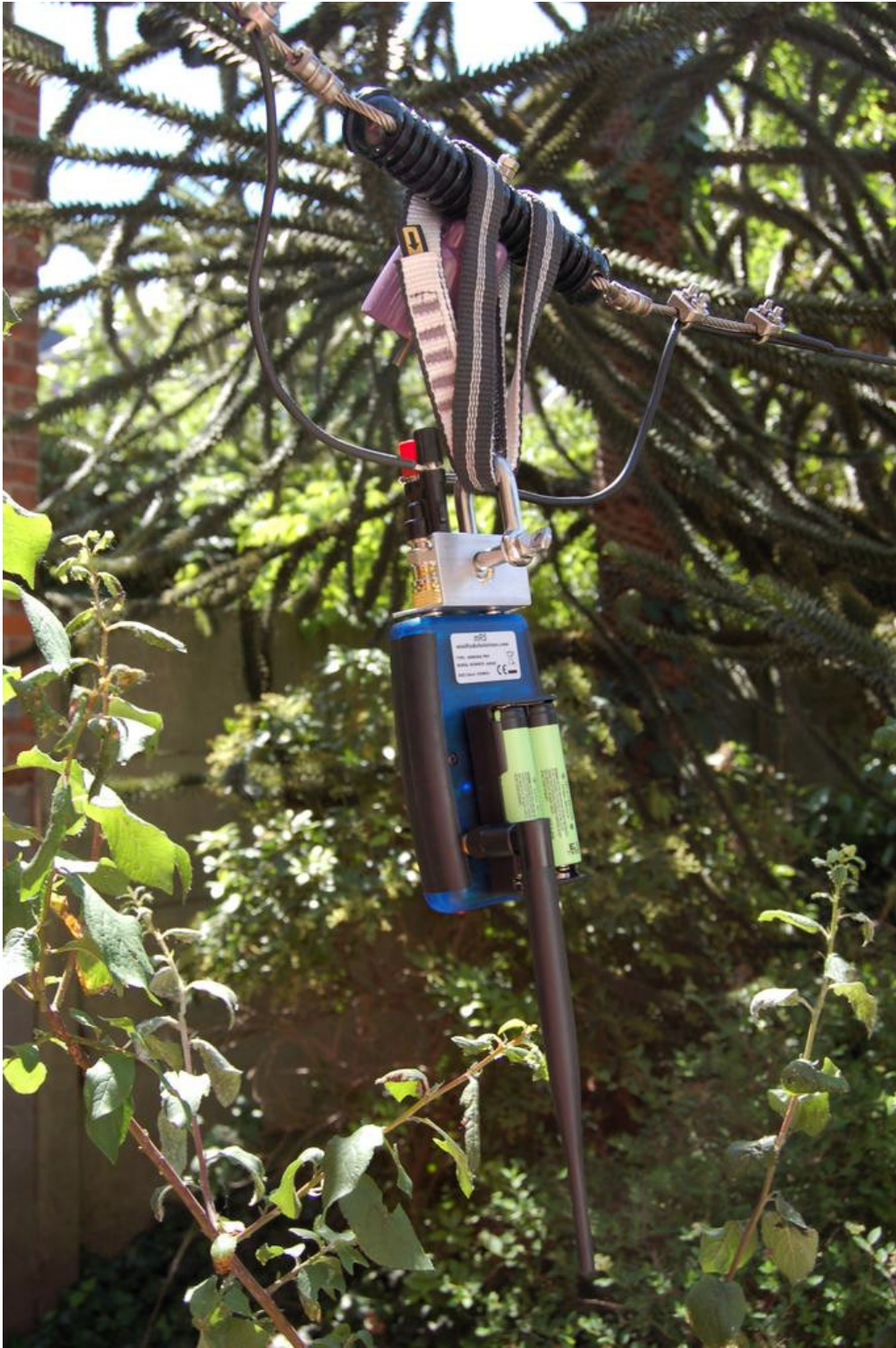
Figure 5: Detail of the modified miniVNA PRO hanging from a lowered wire antenna in my urban jungle. A stainless steel D-shackle and a 30 cm (1 ft) mountaineering sling are used to secure the VNA to the antenna's center insulator. Prior to taking any measurements, the VNA was properly calibrated at the banana terminals.