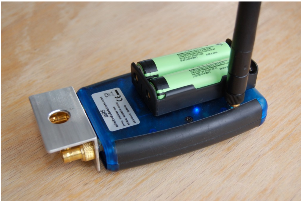
Figure 1: External view of the heavily modified miniVNA PRO showing the external Li-ion battery pack, an external 2.4 GHz Bluetooth antenna and an aluminium hanging bracket held down by two SMA to BNC connector adapters. A steady blue LED is indicative of a stable Bluetooth connection.

The advantage of having an external battery holder is that cells can easily be removed to be charged in a much more reliable and faster Li-ion battery charger, like for example the Nitecore NEW i4 .